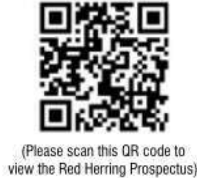
(Please scan this QR code to view the Red Herring Prospectus)

THIS IS A PUBLIC ADVERTISEMENT FOR INFORMATION PURPOSES. THIS IS NOT A PROSPECTUS ANNOUNCEMENT AND DOES NOT CONSTITUTE AN INVITATION OR OFFER TO ACQUIRE, PURCHASE OR SUBSCRIBE TO SECURITIES. NOT FOR PUBLICATION OR DISTRIBUTION, DIRECTLY OR INDIRECTLY OUTSIDE INDIA.